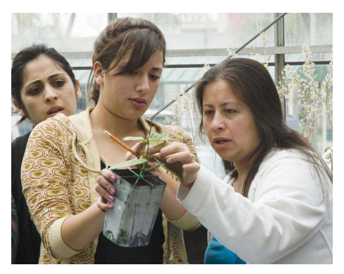
California State University, Los Angeles

Do students and faculty members work together on committees and projects outside of course work? 59% of FY students at least occasionally spent time with faculty members on activities other than coursework.